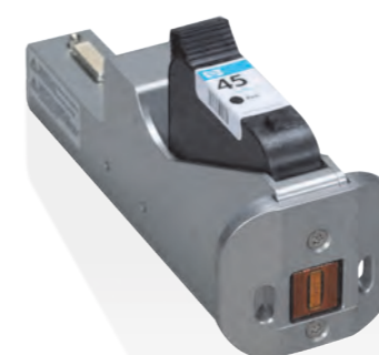
HP printhead (model 1)