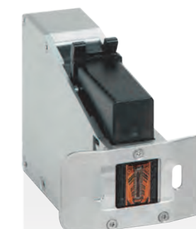
LX printhead (model 1)