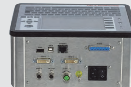
Ethernet Interface Data transfer from networks and access via web interface