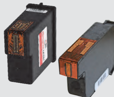
LX and HP cartridge Dual channel jet technology ensures perfect print quality